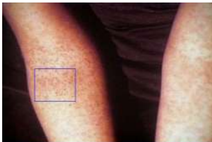
FigureN4: "positive" tourniquet "test" showing ">20" petechiae "in" "2.5cm" square "on" the "skin" surface "of" forearm.