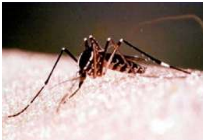
Figure-1: Aedes aegypti mosquito

Dengue is the most huge mosquito-borne viral infection on the planet today. Roughly 3 billion individuals overall live in territories in danger for transmission of the dengue flavivirus by the Aedes aegypti mosquito, and an expected 100 million individuals overall are tainted with the infection every year.