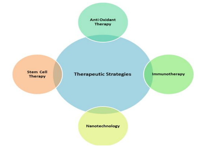
Fig 2: Therapeutic Strategies employed to treat Neurodegenerative Disorders.