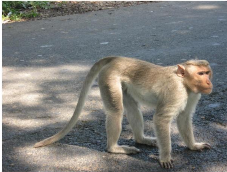
Figure .2 An adult male bonnet macaque on a paved road near Suryakad, Tamil Nadu state. The round bonnet, long tail and cheek-pouch are visible (Photo credit: Author).

Sinha and partners (2003, 2005), above all announced the event of a huge extent (roughly half) of exceptional single-male yet multifamily troops (hereafter alluded to as „unimale troops“) in this populace. As indicated by them, the presence of quite a social association in the species had once in a while been accounted for in before examines or had been seen in extremely low extents.