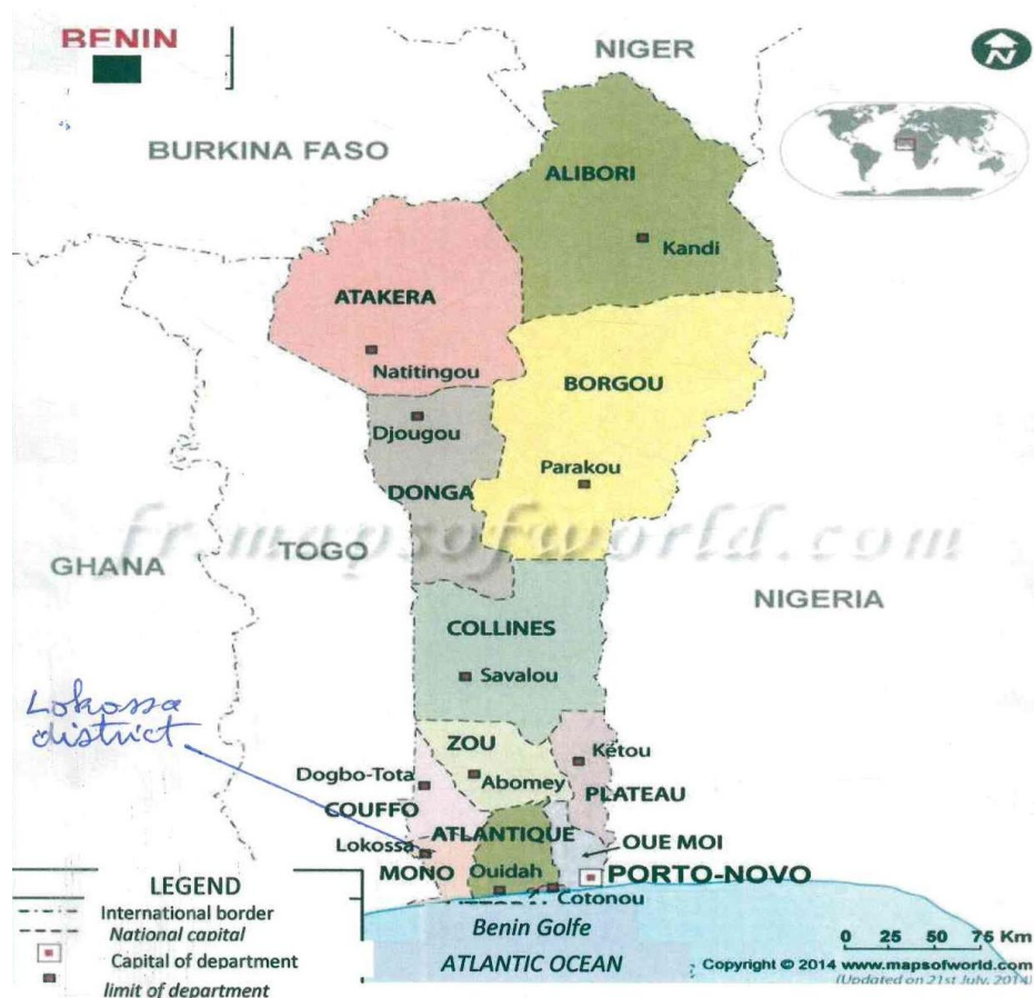
Figure 1: Map of Republic of Benin showing Lokossa District Surveyed

The study area is located in Republic of Benin (West Africa) and includes the department of Mono. Mono department is located in the south-western Republic of Benin and the study was carried out in Lokossa district (Figure 1). The southern borders of this district are Athiémé and Houéyogbé districts. The northern border is Dogbo district. The eastern border is Bopa district and the western border is Togo republic. Lokossa district covered 260 km 2 . The choice of the study sites took into account the economic activities of populations, their usual protection practices against mosquito bites and peasant practices to control farming pests. We took these factors into account to study the larvicidal activities of Bacillus thuringiensis (Bt) on larvae of Culex quinquefasciatus in lymphatic filariasis vector control in Lokossa district in south-western Republic of Benin, West Africa. Lokossa has a climate with four seasons, two rainy seasons (March-July and August-November) and two dry seasons (November-March and July-August). The temperature ranged from 25 to 32°C with the annual mean rainfall, which is between 900 et 1100 mm.