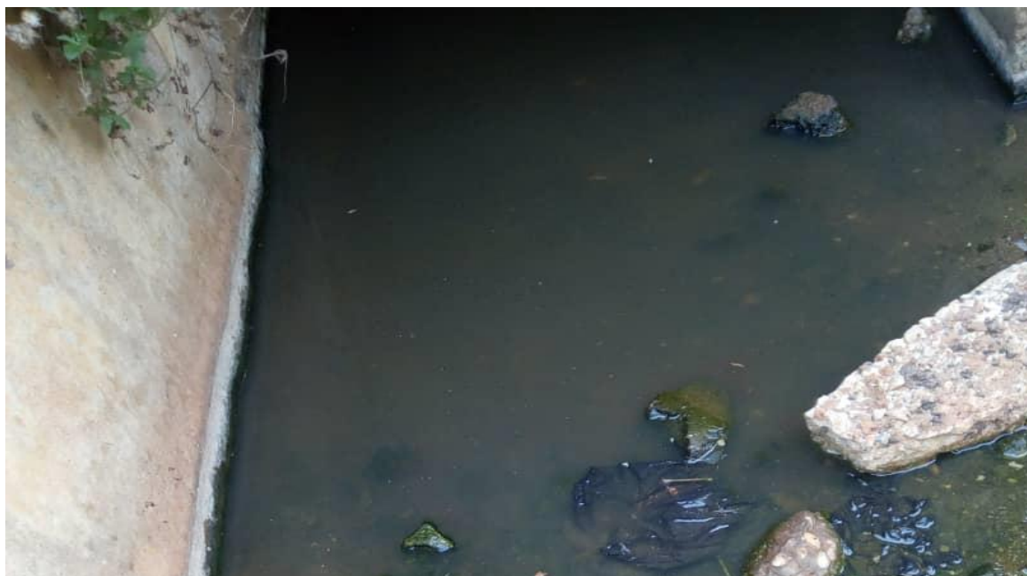
Figure 2: Culex quinquefasciatus larvae breeding site surveyed in Lokossa district

Culex quinquefasciatus larvae were collected from September to November 2024 during the small rainy season in Lokossa district. Larvae were collected from breeding sites using the dipping method and kept in labeled bottles (Figure 2). The samples were then carried out to the Laboratory of Pluridisciplinary Researches of Technical Teaching (LaRPET) in the Department of Sciences and Agricultural Techniques located in Dogbo district.