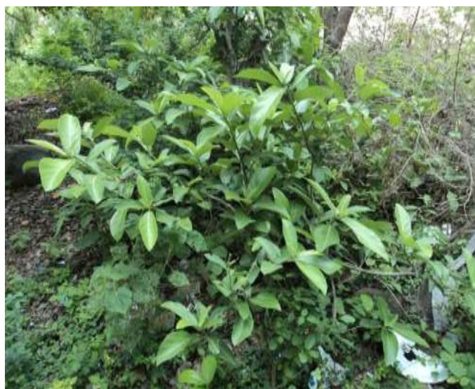
Figure 1. Picture of Ficus hispida plant

In conclusion substantial amounts of silver nanoparticles (AgNPs) were produced and this was verified using UV-visible Spectroscopy. Appearance of a Surface Plasmon Resonance (SPR) peak, which corresponds to the silver nanoparticles. In conclusion based on our results, silver nanoparticles synthesized by plant extract showing a great promising antimicrobial activity. Applications of Ag nanoparticles based on these findings may lead to valuable discoveries in various fields such as antimicrobial systems and pharmaceutical applications.