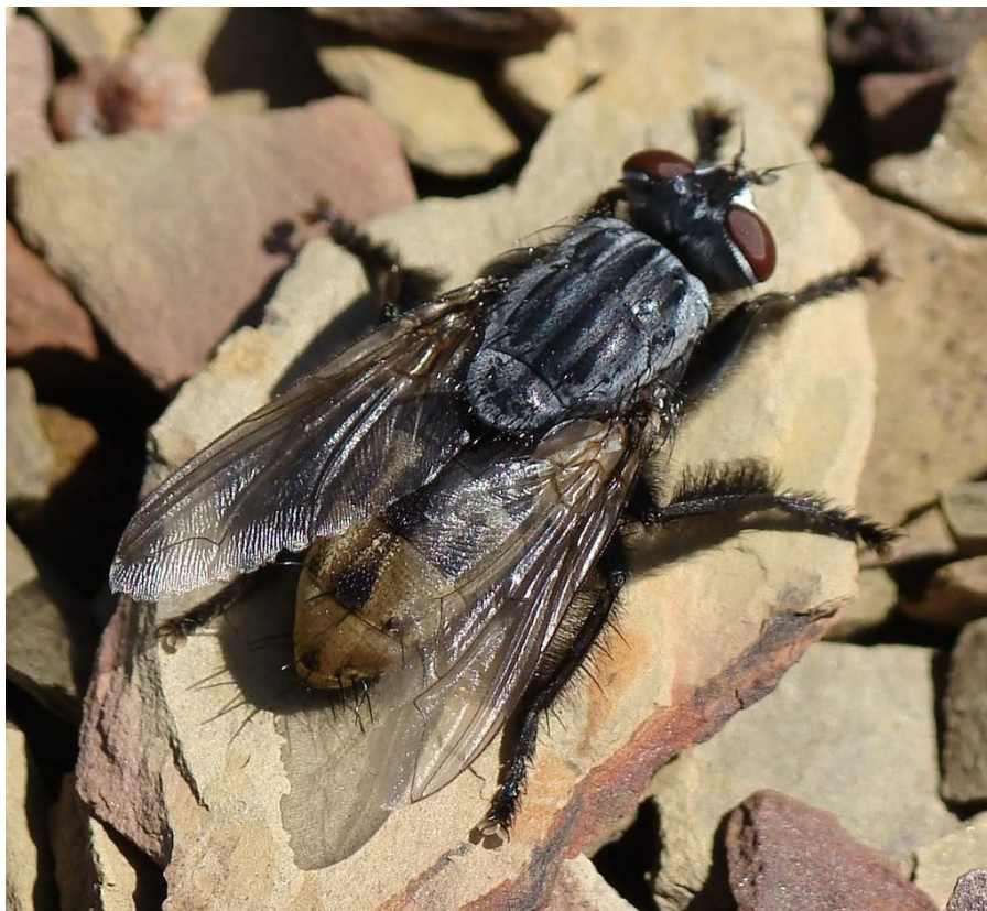
Flesh fly ( Wohlfahrtiamagnifica )