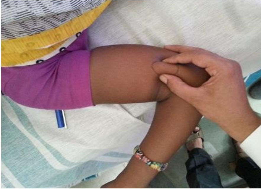
Fig 1: Enlarged lymph node