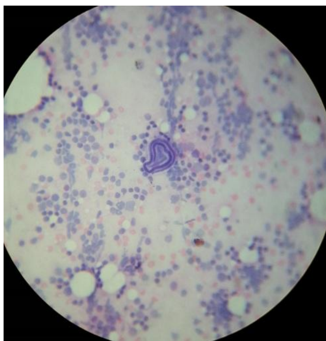
Fig4:Second microfilaria H & E 40X