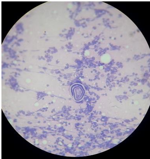
Fig3: First microfilaria H& E 40 X